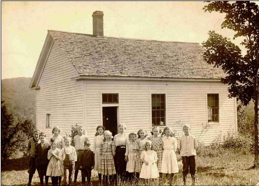
Center School, circa 1911

The Barkhamsted Historical Society's one room schoolhouse, the old Center School on Center Hill Road (Rt. 181) just north of the intersection with Beach Rock Road in Barkhamsted, will be open to the public this coming Sunday, September 28th, from 1:00 to 4:00 PM. Come and find out what school was like in "the old days." Ask questions; read the old books; review a high school entrance exam; try your hand at various toys and games, or do some arithmetic problems on a slate. All free of charge !