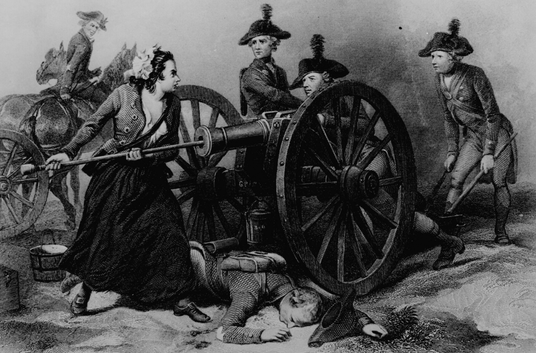
The Battle of Monmouth, June 1778.