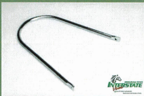
Post & Rail Loop Latch