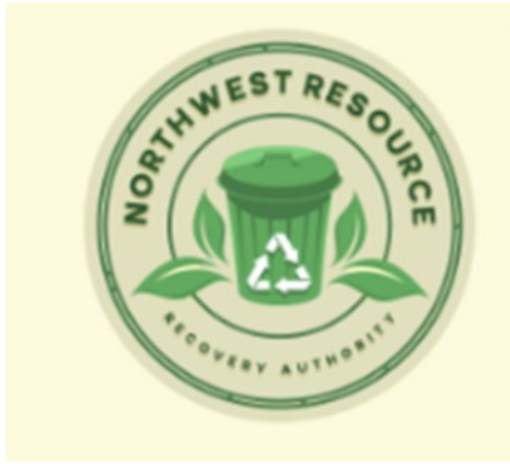
Northwest Resource Recovery Authority