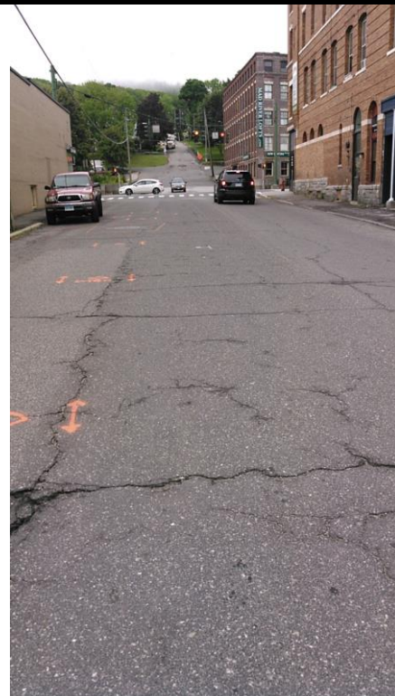
Photo 1. Elm looking to Main

Sidewalks – The sidewalks are in generally poor condition having been overlayed with asphalt and are made of several different materials.