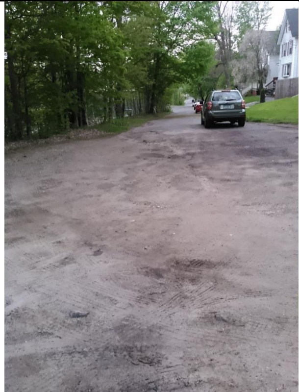
Photo 1. Looking South to John St

Sidewalks – The sidewalks are in poor condition, or they are not present.