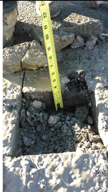
Photo 1. Crumbling Concrete on Deck

Bridge condition – The Bridge Deck is in poor condition. The substructure is in good condition, but, treatment is needed in order to extend its life. A Preliminary Engineer's report is available to describe its condition.