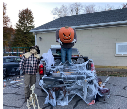
Last Years Trunk-or-Treat

If you would like to register a car for Trunk or Treat, contact the Recreation Department at (860) 738-6964.