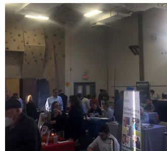
Last Years' Job Fair